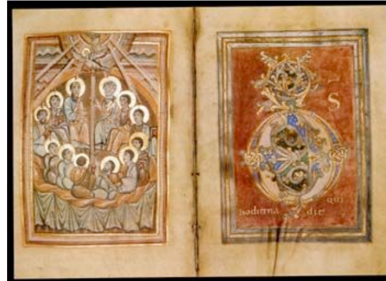
Fig. 14 Pentecost from a sacramentary from Mainz, around 1100. MS Mainz, Domschatz (Diözesanmuseum), Cod. Kautzsch 4, f. 108v.