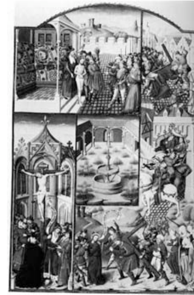
Fig. 12 Henricus Suso, L'Horloge de sapience , ca. 1450-1460. MS Brussels, Bibliothèque Royale, IV 111.