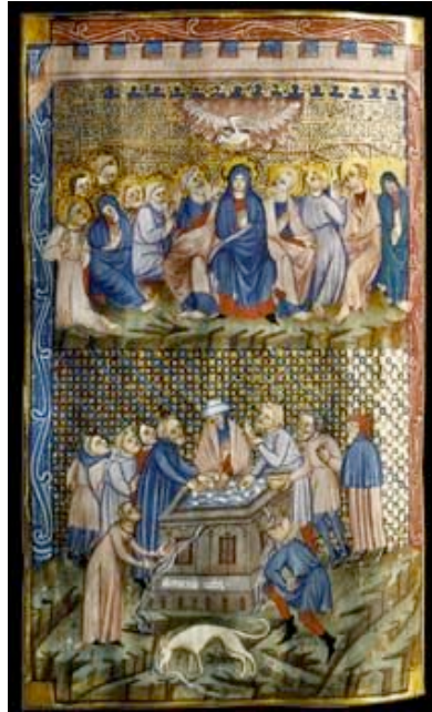
Fig. 21 Gospels of Kuno of Falkenstein, c. 1380. Pentecost and fountain. MS Trier, Domschatz 66.