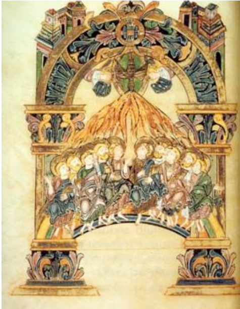
Fig. 5 Pentecost. Benedictional of Æthelwold, MS London, British Library, Add. 49598, f. 67v.