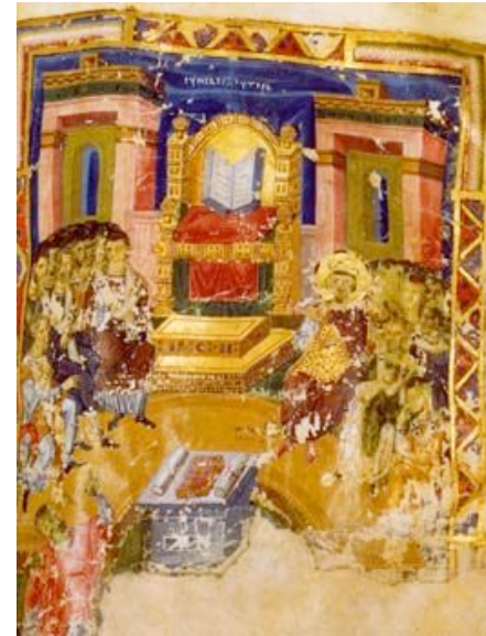
Fig. 2 First council of Constantinople, from Gregory of Nazianzus, Homilies , MS Paris, Bibliothèque Nationale, grec 510, f. 335r (ca. 880).