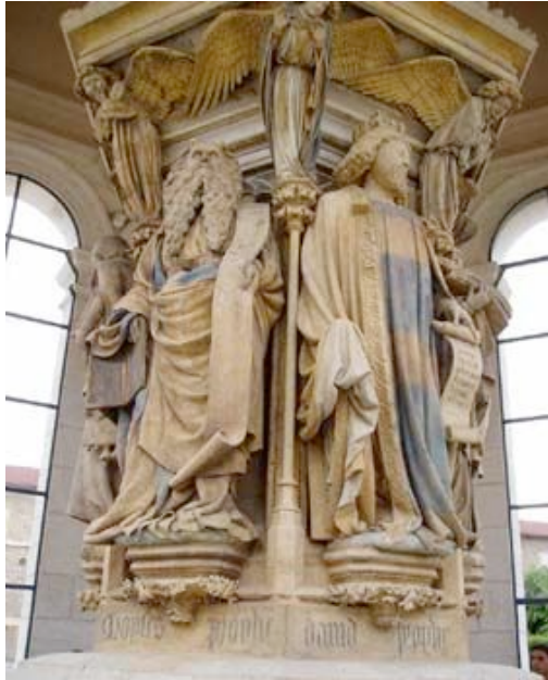
Fig. 11 Claus Sluter, Well of Moses, Chartreuse de Champmol, Dijon, 1395-1406.