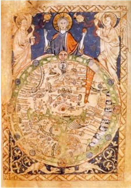
Fig. 13 Map of the world, centred on Jerusalem; from an English psalter of the first half of the thirteenth century. MS London, British Library, Add. 28681, f. 9r.