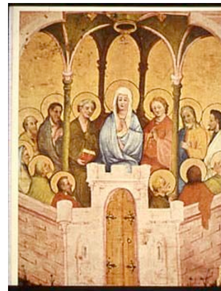
Fig. 4 Pentecost, retabel from the Middle Rhine region, early fifteenth century. Utrecht, Museum Het Catharijneconvent.