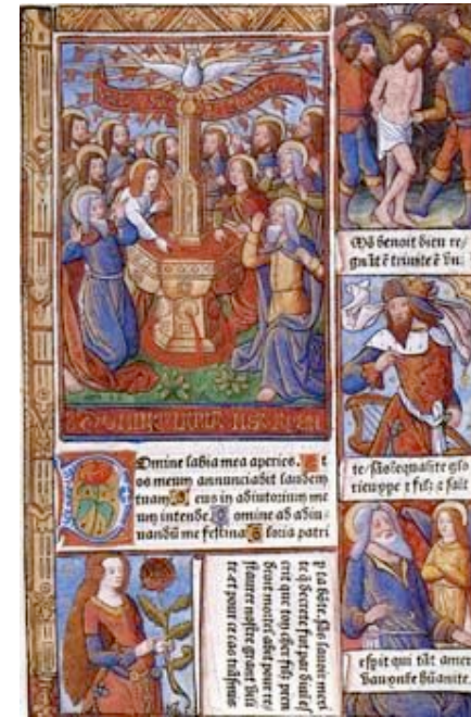
Fig. 22 Pentecost, with fountain of wine or fire, woodcut from the Grandes Heures Royales , printed by Vêrard (Paris, after 20 August 1490). New York, The Pierpont Morgan Library, PML 127725 (ChL 1523B), f. a5r.