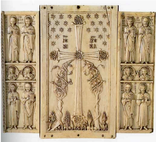
Fig. 9 Harbaville Tryptich, ivory, late tenth century. Back, wings closed. Paris, Musée du Louvre.