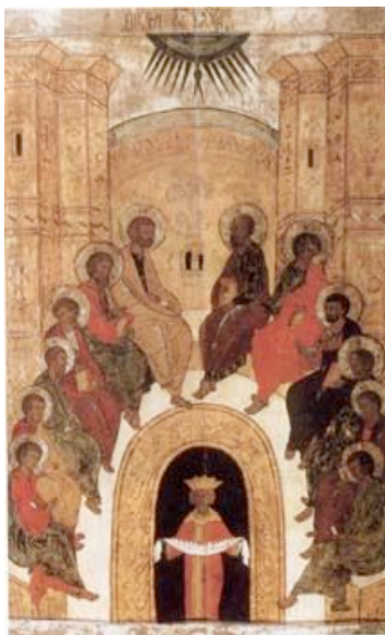
Fig. 3 Russian icon, seventeenth century, present whereabouts unknown. See also Colour Plate 1.