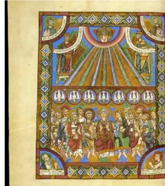
Fig. 20 Pentecost, Gospels of Henry the Lion, 1185-1188, MS Wolfenbüttel, Herzog August Bibliothek, Cod. Guelf. 155 Noviss. 2° / München, Bayerische Staatsbibliothek, Clm 30055, f. 112v.