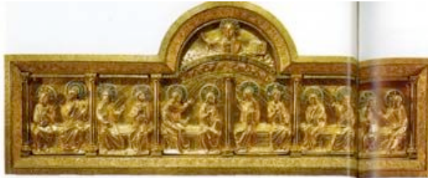
Fig. 19 Pentecostal altarpiece (Stavelot Retable), gilded copper on wood, ca. 1060-1070, 7 columns. Paris, Musée de Cluny, Cl. 13247.