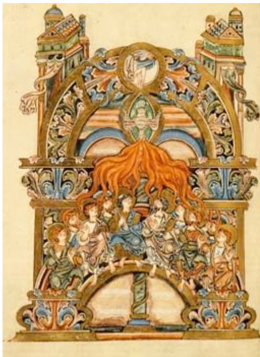
Fig. 15 Pentecost with column in the centre. Benedictional of Robert de Ju-mièges, second quarter of the eleventh century. MS Rouen, Bibliothèque Municipale, Y 7, f. 29v.