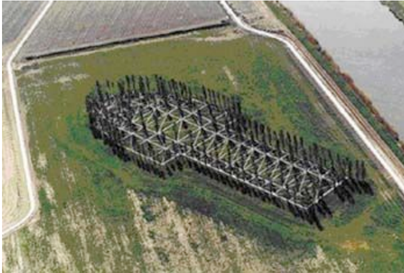
Fig. 23 Marinus Boezem, Gothic Growth Project ('Green Cathedral'), in Almere-East, Flevoland, Parcel KZ 45. 1978/1987-present. 174 Italian poplars ( Populus nigra italica ), stone, concrete, shells. After E. VAN DUYN and F. WITTEVEEN, Boezem (Bussum, 1999), pp. 76-77.