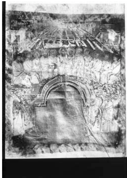
Fig. 1 Pentecost, from a copy of Gregory of Nazianzus, Homilies , datable to ca. 880, MS Paris, Bibliothèque Nationale, grec 510, f. 301r.