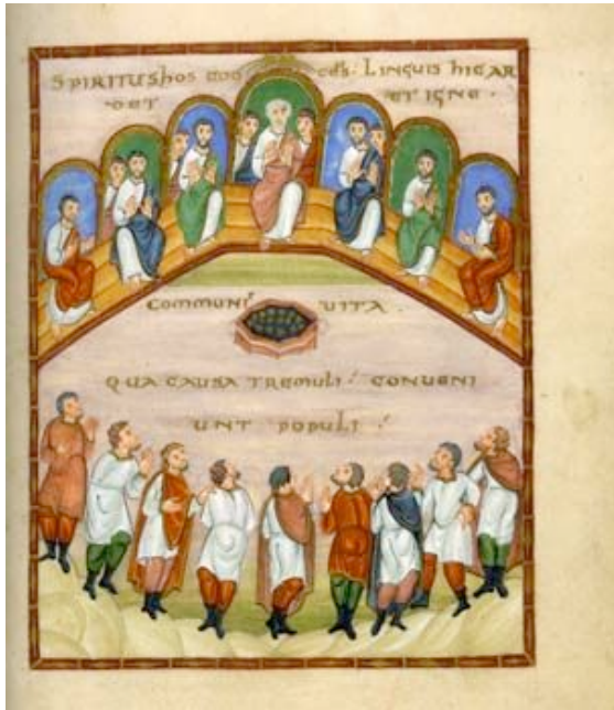
Fig. 7 Pentecost with communis vita in the centre. Codex Egberti, ca. 980. MS Trier, Stadtbibliothek 24, f. 103r.