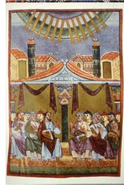
Fig. 18 Pentecost with one column. Evangelistary (Bernulphus codex), Reichenau, ca. 1040-1050. MS Utrecht, Museum Het Catharijneconvent, ABM h 3.