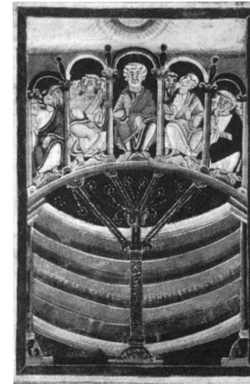
Fig. 8 Pentecost with Tree of Life in the centre. Pericopes from Echternach, early twelfth century. MS Brussels, Bibliothèque Royale, 9428, f. 104v.