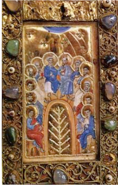
Fig. 17 Diptych of King Andreas III of Hungary, 1290-1296. Chrystal miniatures on lime wood, cameos, pearls, etc. Detail left wing: Pentecost. Bern, Historisches Museum, Inv. Nr. 301.