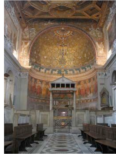
Fig. 10 Apse, Church of San Clemente, Rome, ca. 1120-1130.