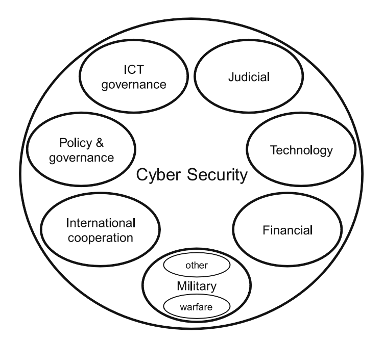
Figure 2. A multidisciplinary and comprehensive response to cyber threats

power or organised armed group, even resulting, in exceptional cases, in participation in an armed conflict. In addition, it is clear that concepts as human rights, privacy and ICT regulations & governance would play a role throughout the whole spectrum. Moreover, although the present chapter and publication are written from a military professional perspective, it should also be made clear that only those operations conducted or supported by armed forces that amount to 'warfare' in the strict sense, only fit as 'cyber warfare', and, even more important, that most cyber security responses will be civil and therefore non-military, as is characterised in Figure 2.