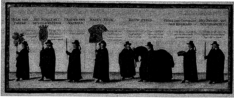
Fig. 2. Funeral Procession of Federick Henry of Orange (detail). Engraving by Pieter Post, 1651. Rijksmuseum, Amsterdam. Used by permission.

That does not mean that these visual records were not intended to be informative, but rather that the form in which this information was given was influenced by artistic and, above all, financial considerations. Because the production of a series of prints was expensive, publishers usually preferred to summarize the event, updating old designs for new events. The result was that these pictorial sources suggest more continuity and imitation of the ceremonial than was really the case. It is therefore doubtful if we should read this suggestion of continuity as an explicit political strategy or ideological message. In the seventeenth century, parallels between series of prints could also be interpreted as a form of artistic imitatio or simply as a sign of the publisher's lack of funds. 27