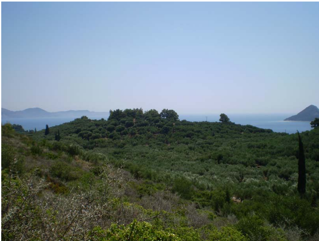
Figure 1: Kokkala hill at Lithakia Kamaroti

Within the framework of the Zakynthos Archaeology Project, the fieldwork of 2012 was conducted during a five week campaign from Monday 18 June to Friday 20 July. In this campaign, five trial trenches were excavated on a hill at Lithakia-Kamaroti in our research area A. In 2009 we have investigated the find concentration at the hill and we concluded that it constituted an important site, with finds from the Early Bronze Age to the Roman period, but the majority of the finds being Mycenaean. In addition to the excavations, some intensive field survey was carried out in an area near Limni-Keriu, which we were not able to finish during 2009. Geomorphological researches were also carried out, and the study of finds from previous campaigns continued. In particular, the research concerning ceramic fabrics and pottery technology progressed significantly. In total, 22 people participated in the 2012 campaign. 1