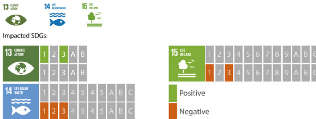
FIGURE 2 – SDGs linked to the environmental aspect (SDGs 13, 14 and 15) and impacted SDG targets.