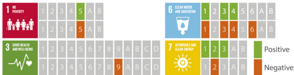
FIGURE 4 – SDGs linked to the social aspect (SDGs 1, 2, 3, 4, 5, 6, 7, 11 and 16) and impacted SDG targets.