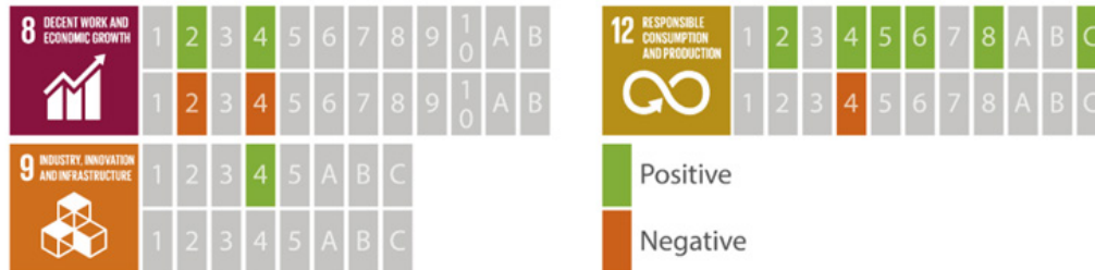
FIGURE 3 – SDGs linked to the economic aspect (SDGs 8, 9, 10, 12 and 17) and impacted SDG targets. SOURCE: Elaborated by authors using SDGs data (UN, 2015).