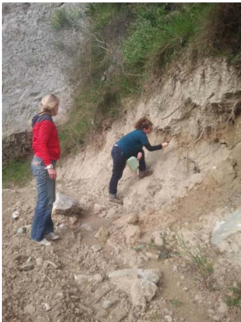
Figure 9 Sampling clay sources on Zakynthos for the technological fabric research

The physical geographical work that was done in 2012 aimed to provide a synthesis of the various studies done in previous campaigns. Detailed descriptions were made of selected landscapes within the three research areas on Zakynthos. The research aims to describe and analyze the formation of the landscape on three levels: in detail around the various archaeological sites (micro scale), a general description of each of the three research areas (meso scale) and an analysis of the formation of the island in general (macro scale).