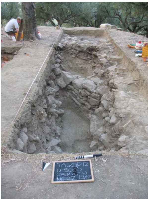
Figure 3: Wall from the Mycenaean period in Trench A

A trench measuring 2,5 x 10 m was set out on the southern edge of the plateau in north-south direction. Below the topsoil, a fill of field stones became visible, which was subsequently removed. The thick fill of boulders yielded Mycenaean pottery, but also tiles, pieces of bone and grinding stones. The tiles appeared to be of Classical-Hellenistic date (5 th -2 nd centuries BC), which would fit well with the fragments of black-glazed pottery that were also found. The stone fill appears to belong to a re-arrangement of the hill during the Classical-Hellenistic period. Tiles and pieces of bone and a human tooth suggest the presence of tile graves from the same period.