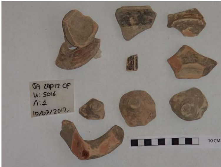
Figure 4: Objects retrieved in and on the upper floor (Unit 5016).

Title Report Zakynthos Archaeology Project 2012