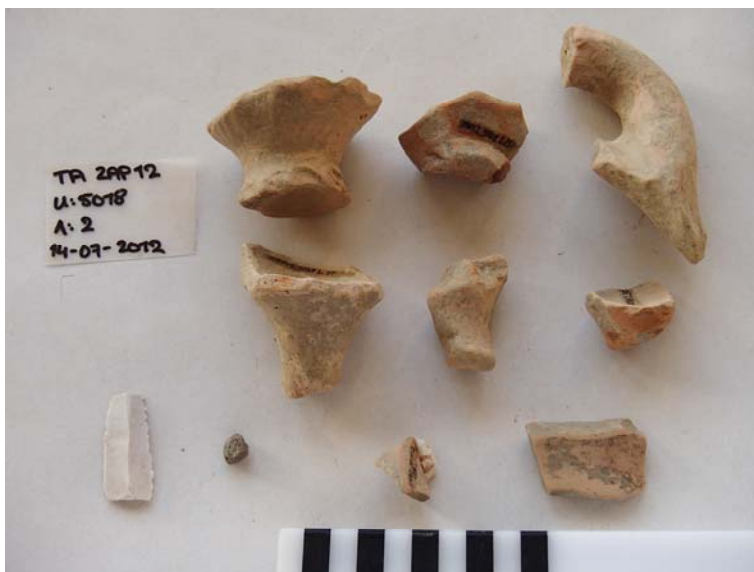
Figure 5: Objects from the lower floor packing (Unit 5018).

Below the upper packing of the floor, a second packing was attested, which was made of harder, grey soil and somewhat larger stones. This packing was 30-38 cms thick. The material found in the packing was somewhat more heterogeneous than that from the layer above (figure 5). The handle of a krater (FS 281) and a deep bowl rim (FS 284) probably date to LH IIIB. But there was also ringless base of a possible LH IIB-III A alabastron, a beautiful flint blade and a bronze nodule. It is not clear whether this lower packing represents the remains of an earlier floor, or whether it is a lower packing of the same floor above. However, considering the more heterogeneous nature of the finds, it is most likely that the lower packing represents an earlier phase of the floor, which can be dated sometime in LH IIIB (ca. 1300-1200 BC).