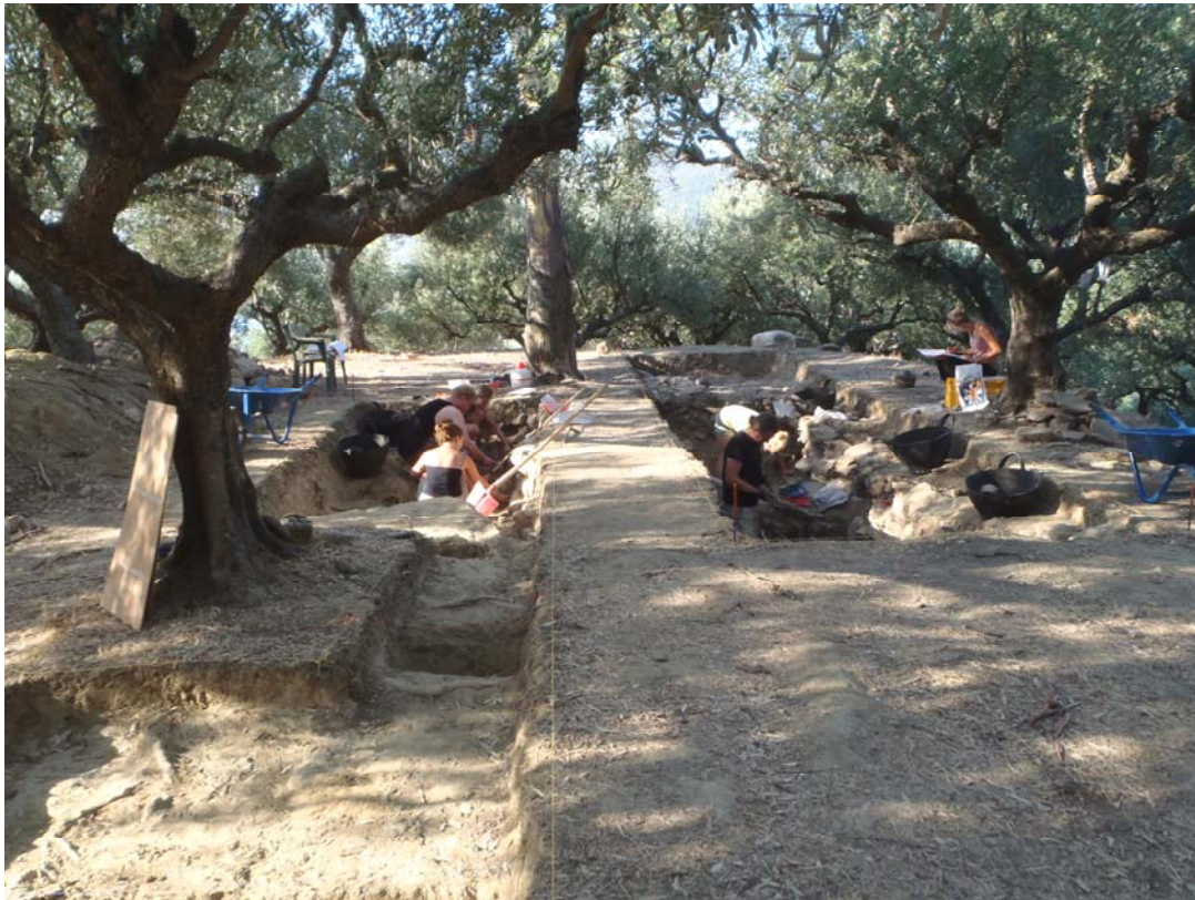
Figure 7: Trenches D (left) and A (right) during excavation

Trench C was situated one terrace below Trench B in an area with high find densities during the survey. Immediately below the topsoil, the tough green-yellow clay loams appeared which are the bedrock of the hill. Some finds came from the topsoil, and these compared well to the survey finds in this area. Most finds could, preliminarily, be dated to the Bronze Age. However, a small piece of a black-glazed cup was also found.