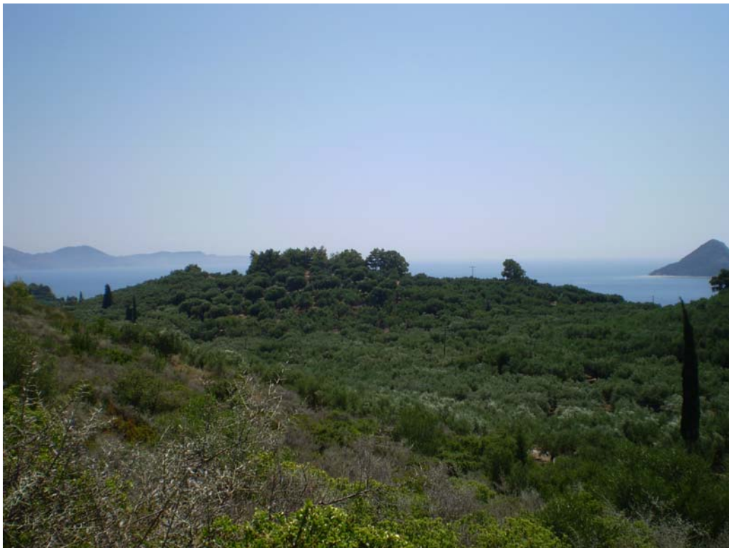
Figure 1: Kokkala hill at Lithakia Kamaroti

Within the framework of the Zakynthos Archaeology Project, the fieldwork of 2012 was conducted during a five week campaign from Monday 18 June to Friday 20 July. In this campaign, five trial trenches were excavated on a hill at Lithakia-Kamaroti in our research area A. In 2009 we have investigated the find concentration at the hill and we concluded that it constituted an important site, with finds from the Early Bronze Age to the Roman period, but the majority of the finds being Mycenaean. In addition to the excavations, some intensive field survey was carried out in an area near Limni-Keriou, which we were not able to finish during 2009. Geomorphological researches were also carried out, and the study of finds from previous campaigns continued. In particular, the research concerning ceramic fabrics and pottery technology progressed significantly. In total, 22 people participated in the 2012 campaign. 1