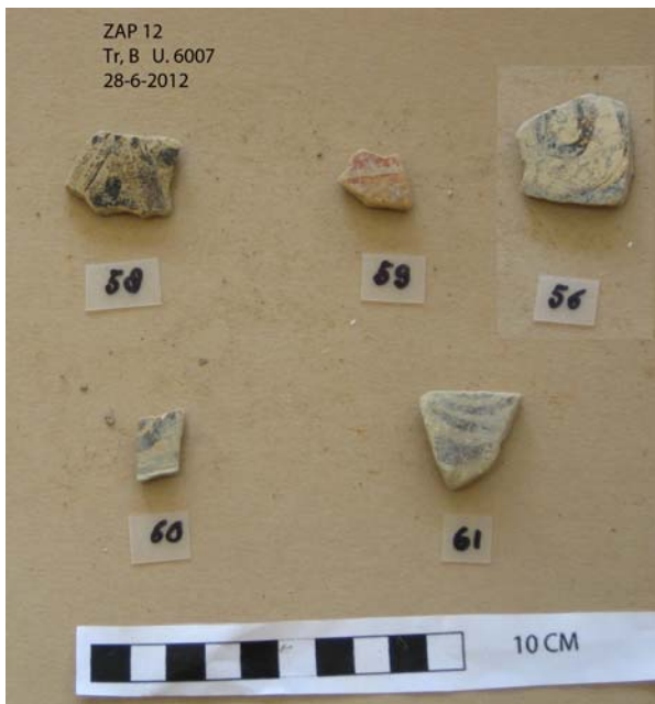
Figure 6: Decorated pottery from the slope deposit in trench B (Unit 6007)

Trench B was situated one terrace lower than Trench A, in a field that had yielded a particularly high densities of finds during the survey. The trench was 4x6 m. and orientated southwest-northeast. Below the top soil bedrock appeared immediately in the greater part of the trench. Bedrock on Kokkala hill consists of tough green-yellow clay loams.