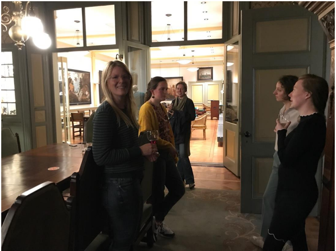
Fig. 3 AUV Members enjoying a post-tour borrel in the Sint Eloyen Gasthuis.

The evening was spent learning about the building followed by a borrel (Figs. 2-3). There were also a few games of kolf, as the St. Eloyen Gasthuis houses an indoor kolf court (Fig. 4). The C&R Alumni Network thanks our hosts at the St. Eloyen Gasthuis and the participants of the excursion for a wonderful event.