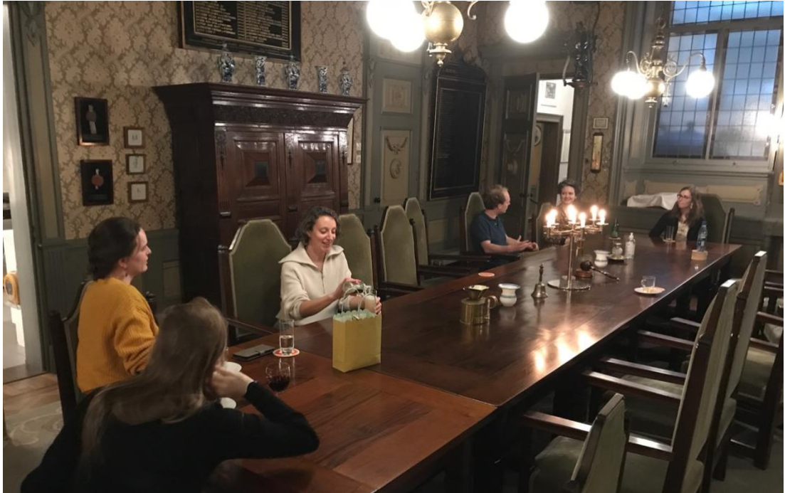
Fig. 1. At the table of the Board of Sint Eloyen Gasthuis, Utrecht.

The members of the Alumni Network Conservation and Restoration went on an excursion event on Friday, October 29th to the St. Eloyen Gasthuis , home to the oldest standing guild in the Netherlands (Fig.1).