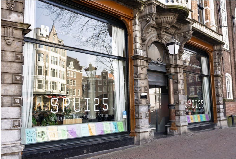
Visitor entrance to SPUI25